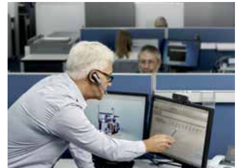
Remote Service: Excellent machine availability thanks to shorter periods of idle time and therefore lower production costs.