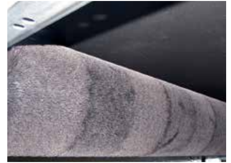
Belt cleaning equipment (option)