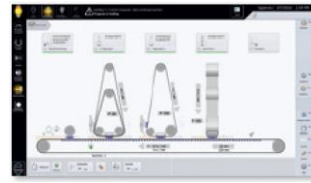
21" Power Touch Control