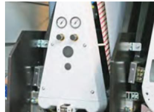
Chevron Belt – Enhanced finish