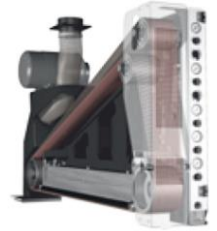
Cross Belt Sanding Head