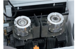
Pre-milling unit with Diamond inserts. 100 mm diameter