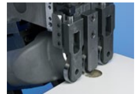
Nested top fine trim with 3 roller tracing