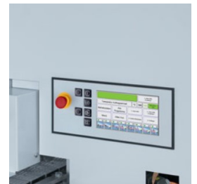
Homag EasyTouch interface machine control