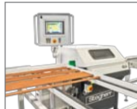
NC Mitre Saw GLS for cutting angles up to +/- 81°