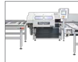
NC Mitre Saw GLS-2 with angle adjustment in two planes