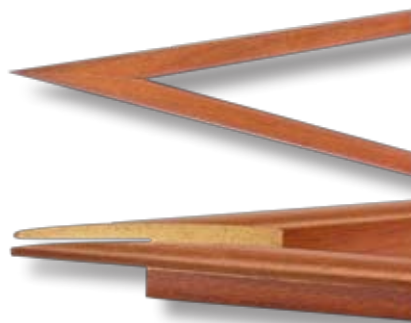
GLS in special execution for cutting angles up to +/-81°

The angles are adjusted either pneumatically or in the machine program over servo controlled axes. Similarly the working stroke can be pneumatic or servo controlled.