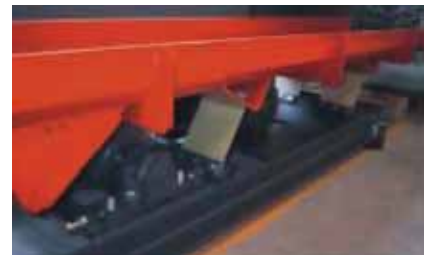
Vibrating conveyor system with integrated drive train