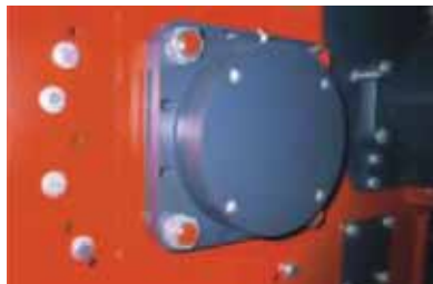
High quality sealed bearings