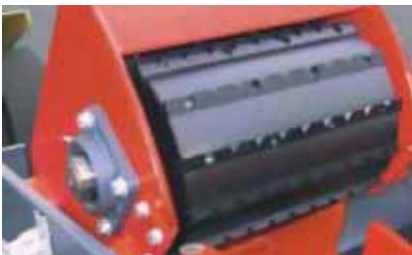
Pinch feed system with replaceable strips